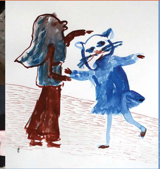
David Cuttleton / NO PARKING