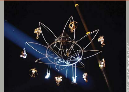
Transe Express

Street entertainers, film, installations, fringe events and pyrotechnics will all feature over