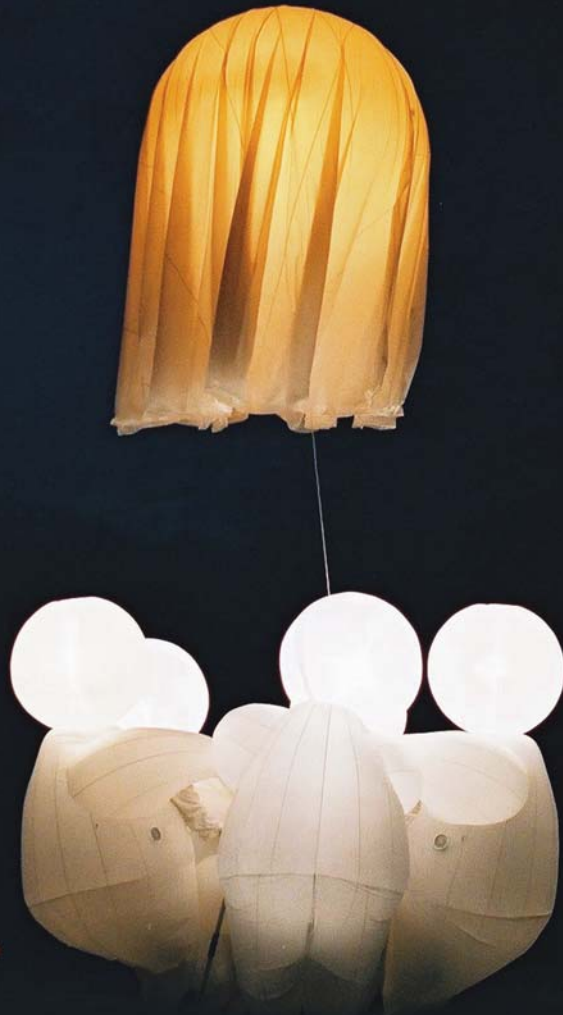
Compagnie des Quidams

Sunday night brings an evening of performance and music from NOPARKING and Hello Hubmarine to mark the end of another spectacular Festé weekend. Tickets: £3 (available from the Box Office)