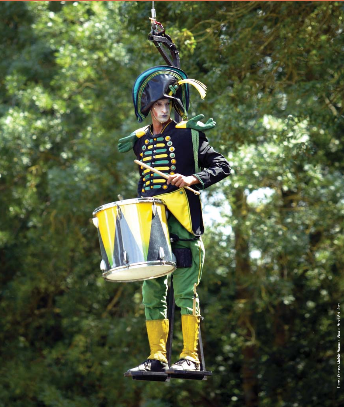
Transe Express Mobile Homme Cover: @ECCO Dance Company